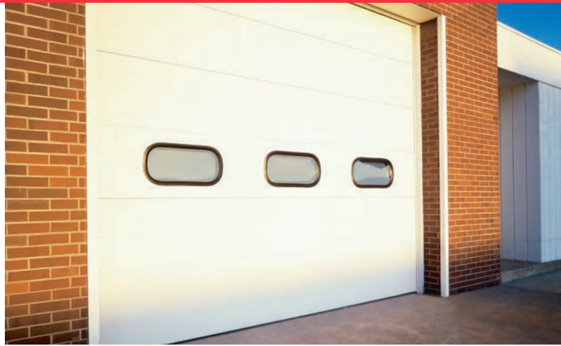
Installation and service: Overhead Door Company of Glens Falls™

It incorporates the Thermacore® steel-polyurethane-steel panel construction, which provides a thermal barrier to withstand harsh climates and demanding environmental requirements. The result is a solid, well-built door that keeps both the weather and unwanted sound at bay.